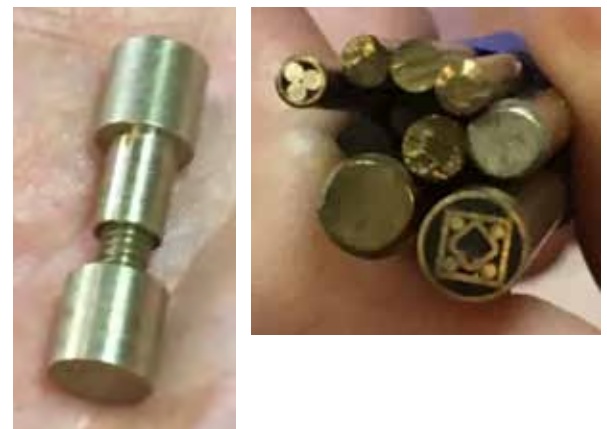
Corby rivets and other rods can be used to secure the handle to the blade.