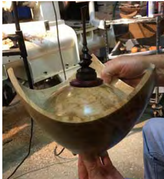
A finished wing bowl made for a show in Vermont.