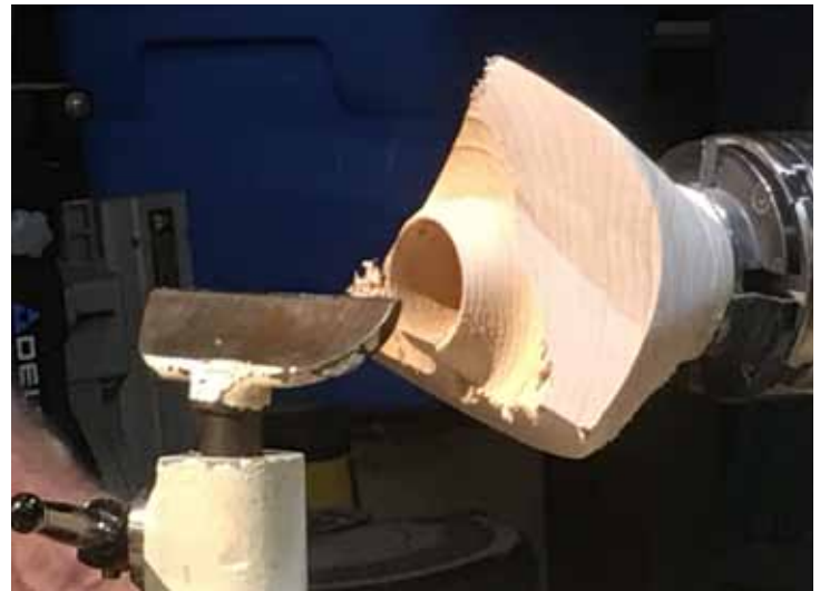
Drill hole before hollowing.