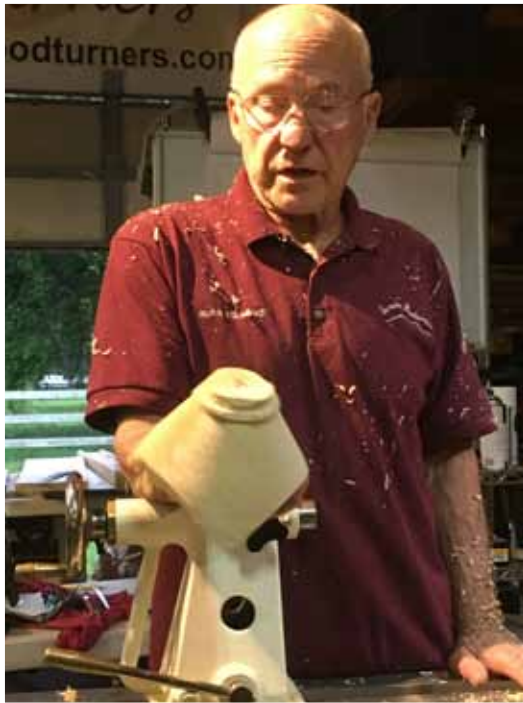
Tonight's demo finish.