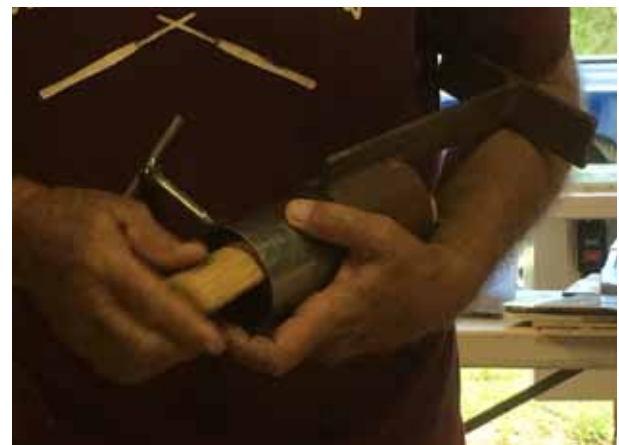
Knife blank vise.