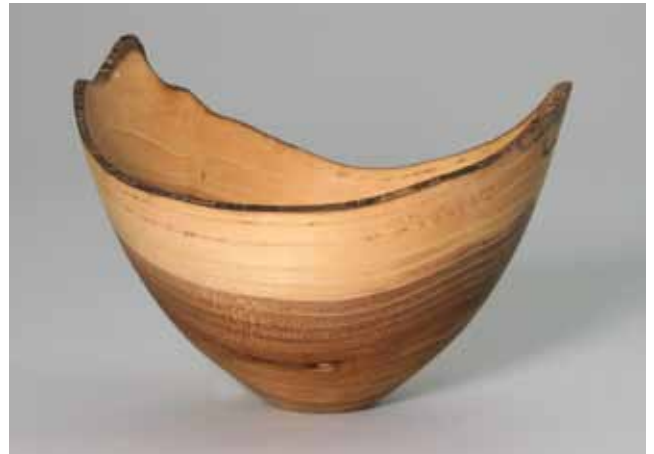
Natural edge bowl made from elm.