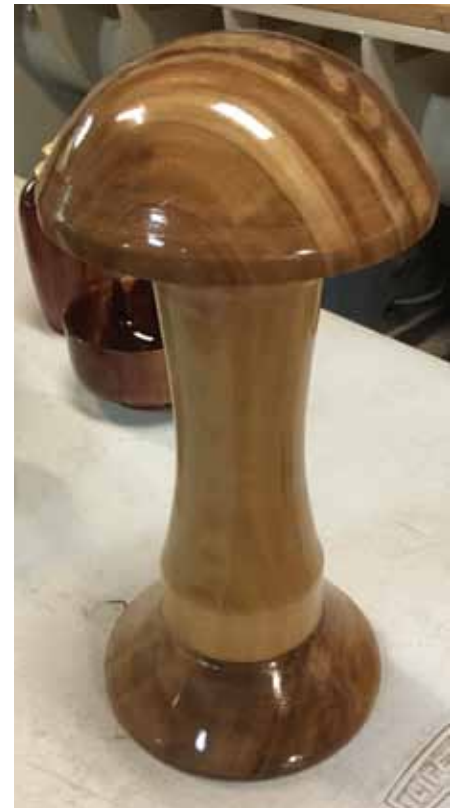
Alan Levin's Camphor wig stand.