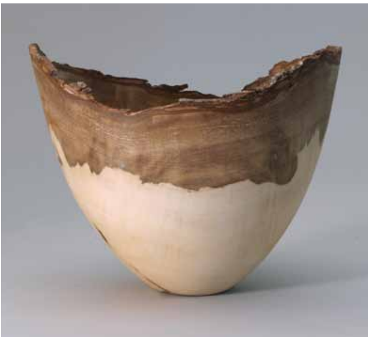
Natural edge bowls made from Chinese Tallow.