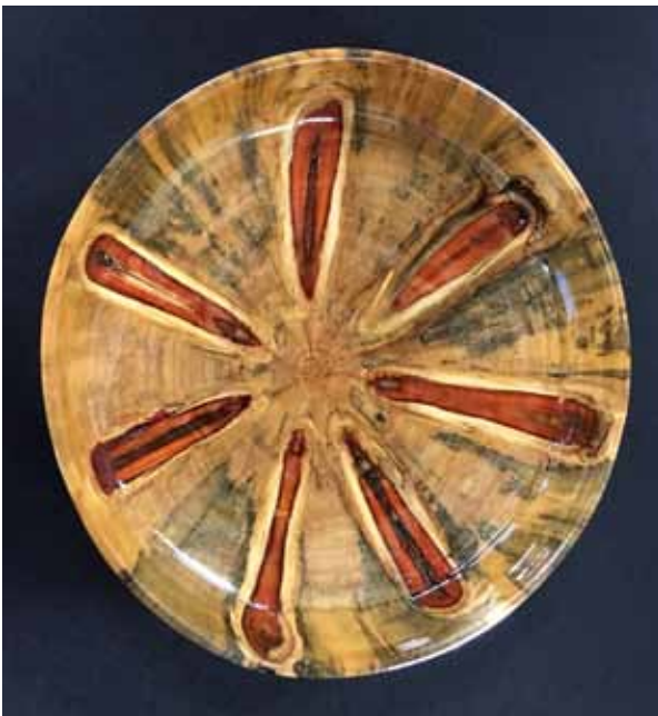
Chet Orzech's Norfolk Island Pine bowl.