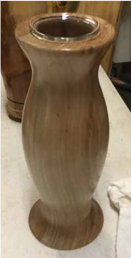
Dave Hausmann's Sycamore flower vase with glass insert.