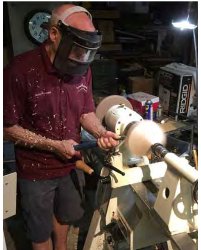
Shape with a parting tool.