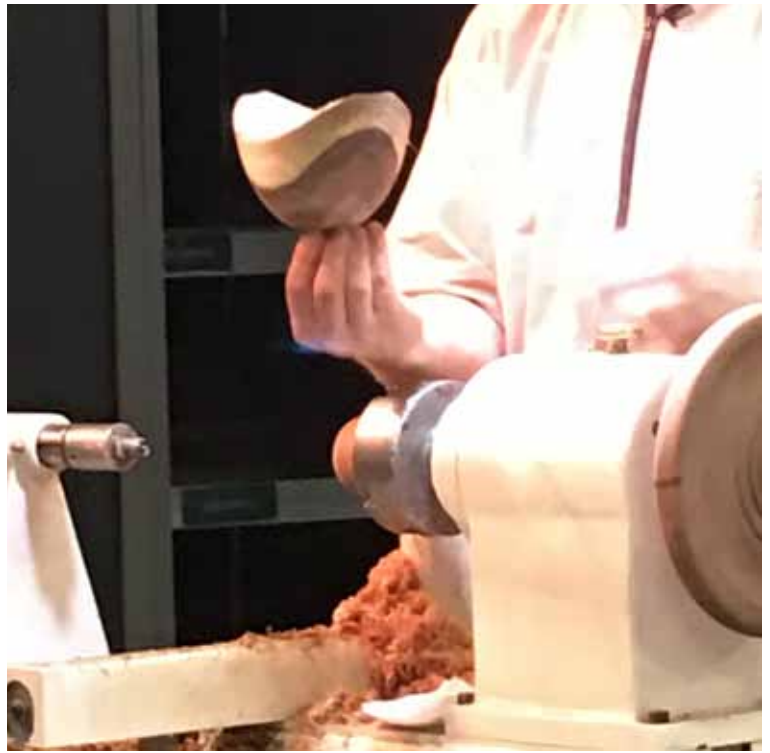
James' natural edge bowl made from rosewood.