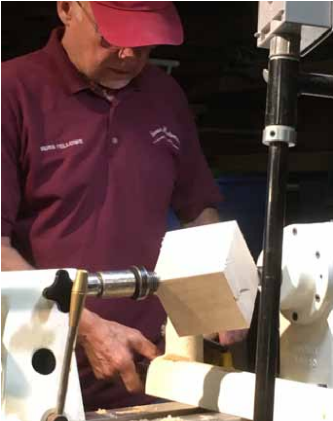
Mounting a maple cube.