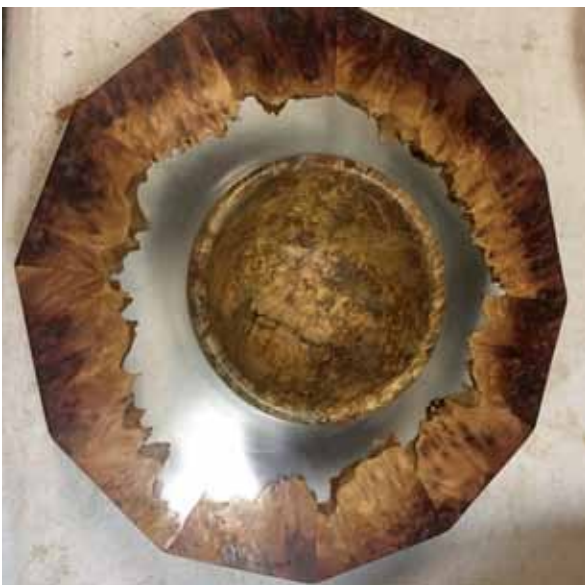
Russ Fellow's acrylic epoxy bowl (an experiment).