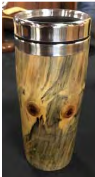
Alan Levin's Norfolk Island Pine mug.