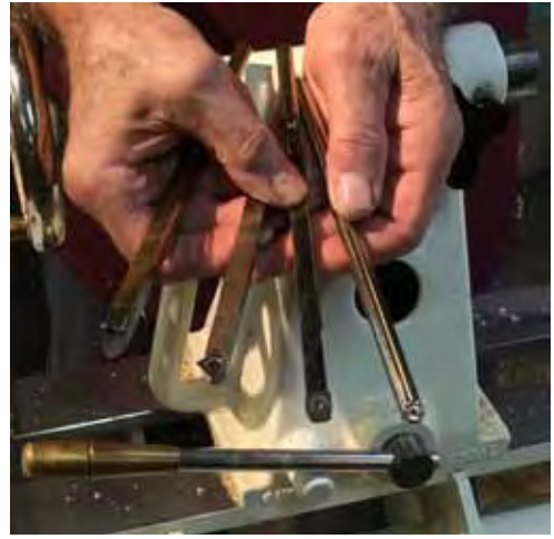
Simon Hope hollowing carbide tip cutting tools.